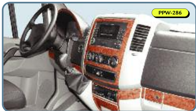
PPW-286 Mercedes Sprinter/VW Crafter 2006 on Extra kit PPW-288 Door pieces also available