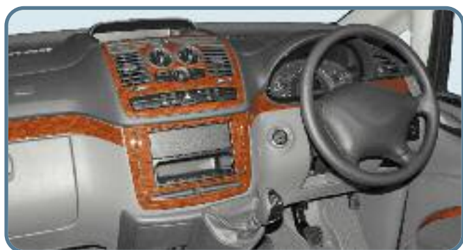
Mercedes Vito 2003 on. Different variants available.

Dash kits supplied as easy-peel sections and with cleaning cloth and instructions.