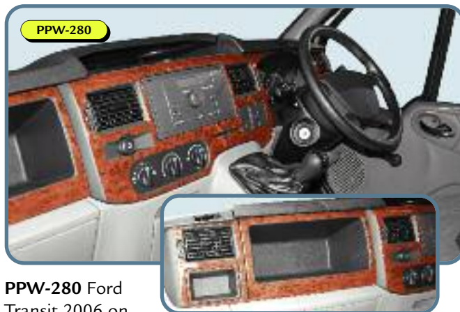
PPW-280 Ford Transit 2006 on