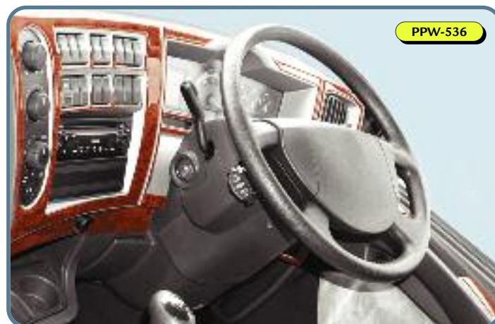
Renault Premium 2005 on