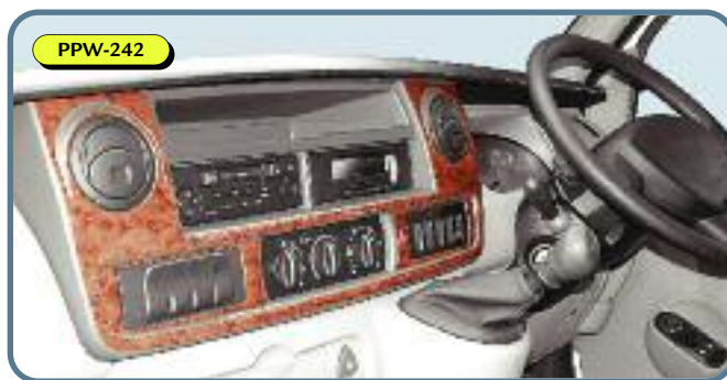
PPW-242 Renault Master 10.03 on

The resulting effect is satisfying and long lasting.