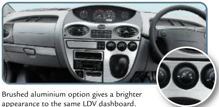
Brushed aluminium option gives a brighter appearance to the same LDV dashboard.