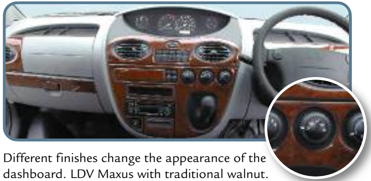
Different finishes change the appearance of the dashboard. LDV Maxus with traditional walnut.

See next page and also our Price List for details of standard kits available.