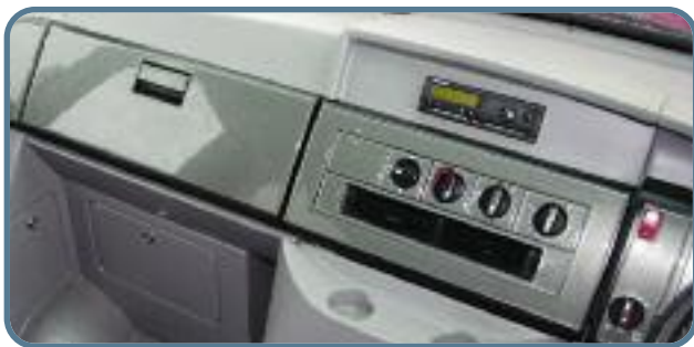
Graphite finish enlivens the full width of the dashboard on this Mercedes Vario luxury minibus.