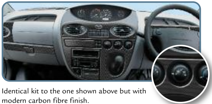
Identical kit to the one shown above but with modern carbon fibre finish.