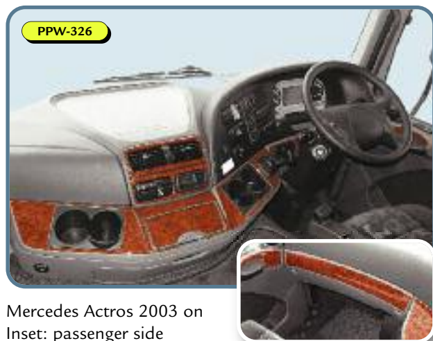
Mercedes Actros 2003 on Inset: passenger side

Other colours and finishes are available to special order such as Aluminium, Carbon Fibre Texture, and attractive wood ranges: Rosewood, Dark Walnut, Honey Walnut and Maple.