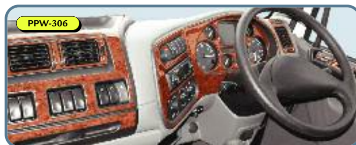
DAF LF 2001 on

The material has a soft flexible feel, is easy to work with and apply, but is also unbreakable, scratch and splinter-proof.