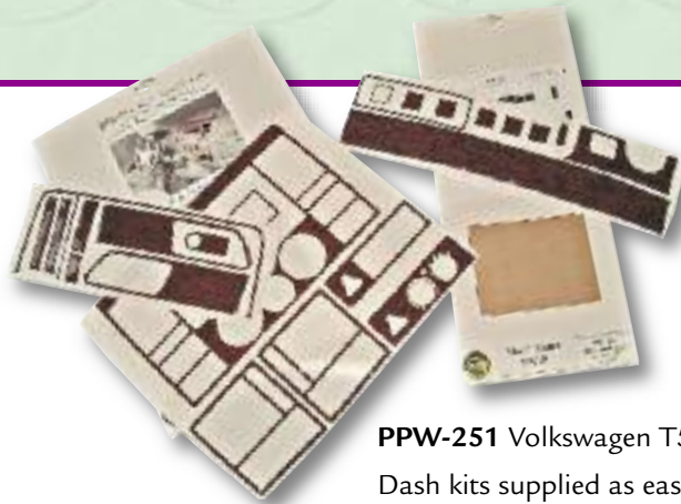
PPW-251 Volkswagen T5

Adding a touch of luxury to a mundane grey dashboard improves the vehicle immeasurably. Minibuses, white vans (and other colours!), horseboxes, people carriers and in fact any light commercial will greatly benefit from the warm comfort of a walnut dashboard or one of our alternative modern finishes.