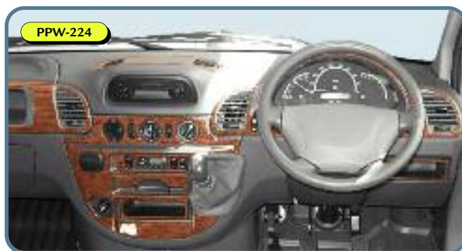
PPW-224 Mercedes Sprinter